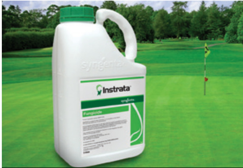
Instrata is the fast-acting turf fungicide for all seasons. Three actives and three-way action makes Instrata the one-product solution for turf disease control.