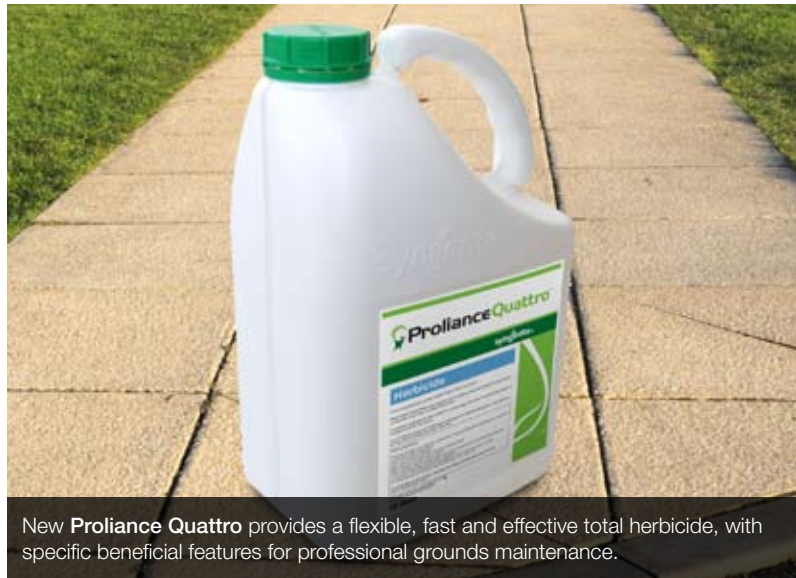
New Proliance Quattro provides a flexible, fast and effective total herbicide, with specific beneficial features for professional grounds maintenance.

Works faster and more effectively in a wider range of conditions